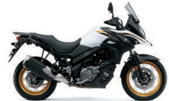
Pearl Glacier White (YWW)

f/Suzuki2wheelers /Suzuki2wheelers t/Suzuki2wheelers You Tube /Suzuki2wheelers