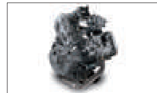
645cm 3 DOHC V-Twin engine