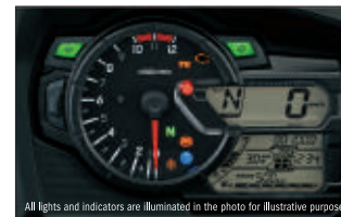
Multi-functional Instrument Panel