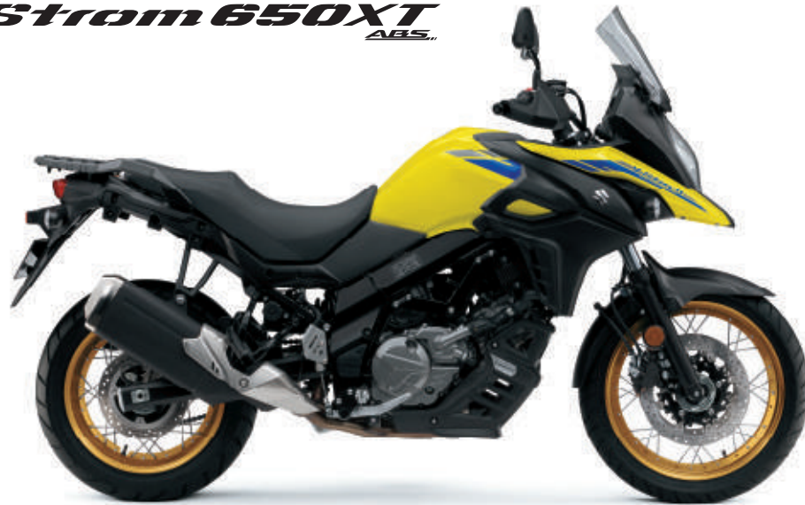
Champion Yellow No.2 (YU1)