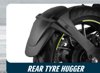
REAR TYRE HUGGER