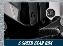
6 SPEED GEAR BOX