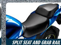
SPLIT SEAT AND GRAB RAIL