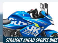
STRAIGHT AHEAD SPORTS BIKE