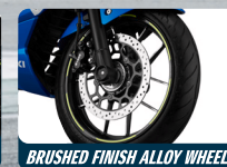
BRUSHED FINISH ALLOY WHEELS