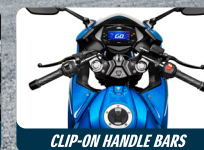
CLIP-ON HANDLE BARS