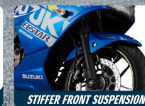
STIFFER FRONT SUSPENSION