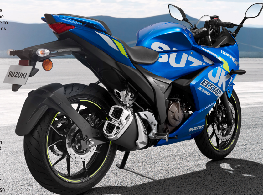
METALLIC TRITON BLUE

Suzuki Oil Cooling System (SOCS) - Oil cooling system in engines was first introduced by Suzuki to the world for creating light weight and fast engines which provides high performance for a wide range of needs, from city-riding in traffic to serious sport riding using technologies derived from MotoGP such as weight-reduction and friction-reduction technologies. This unique technology also offers a refined acceleration that feels strong and linear. GIXXER SF 250 engine provides high output, compactness, low fuel consumption, high durability and ease of maintenance.