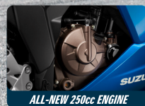
ALL-NEW 250cc ENGINE