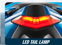
LED TAIL LAMP