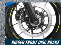
BIGGER FRONT DISC BRAKE