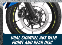
DUAL CHANNEL ABS WITH FRONT AND REAR DISC