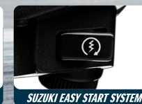
SUZUKI EASY START SYSTEM