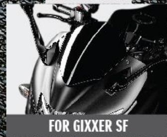
FOR GIXXER SF