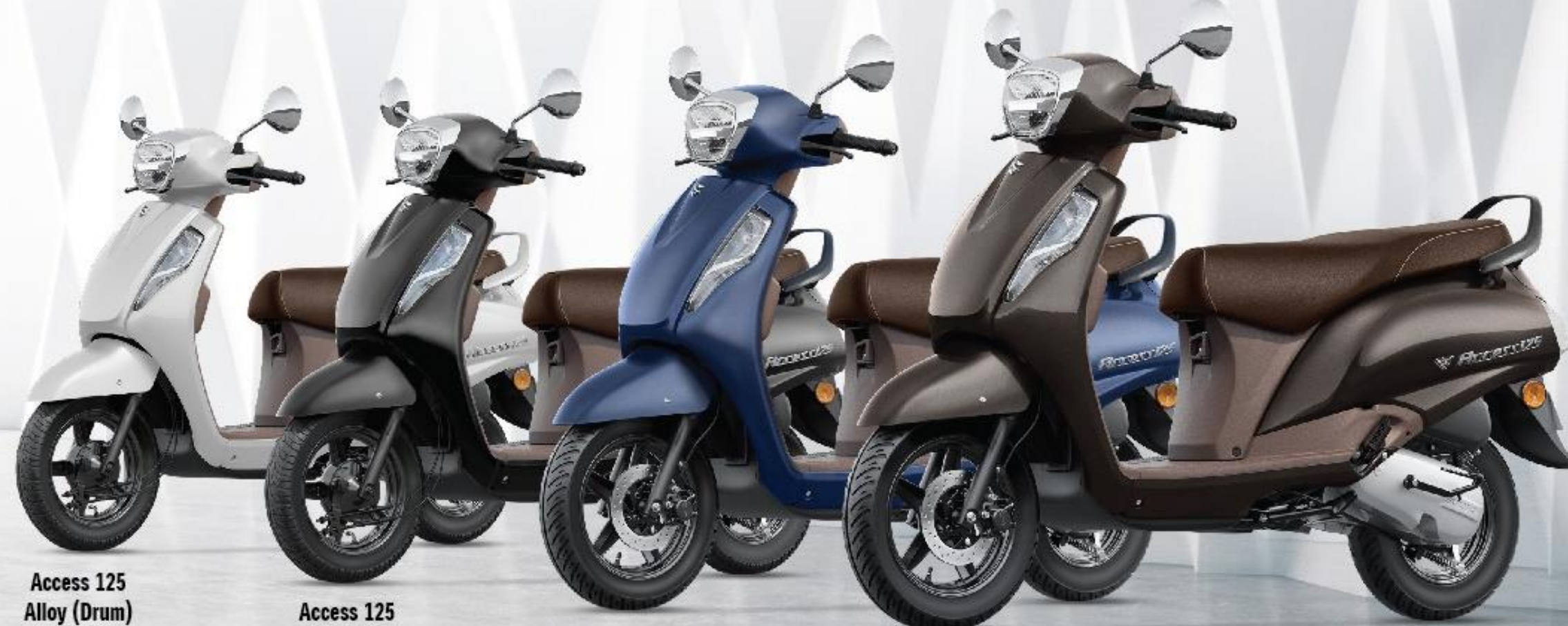
Access 125 Alloy (Drum)