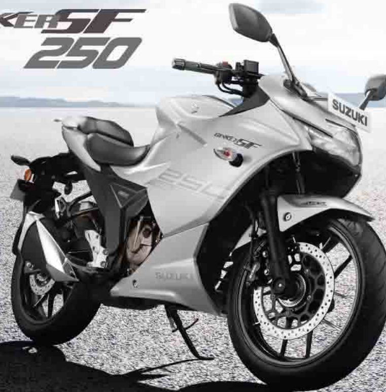
■ METALLIC MATTE PLATINUM SILVER