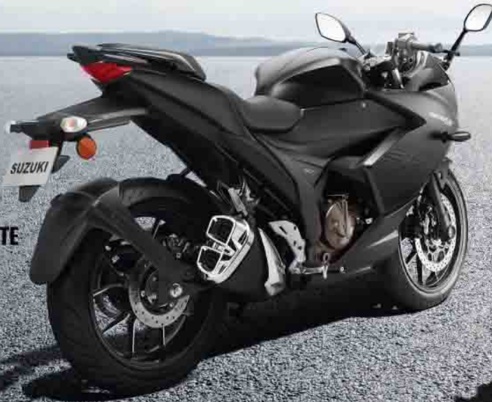
■ METALLIC MATTE BLACK