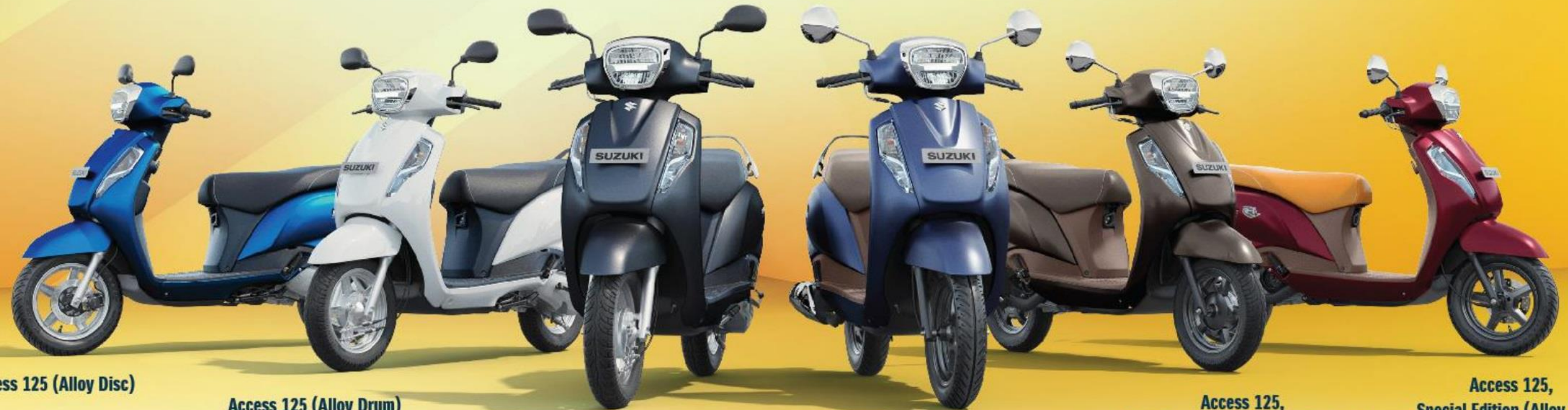
Access 125 (Alloy Disc)